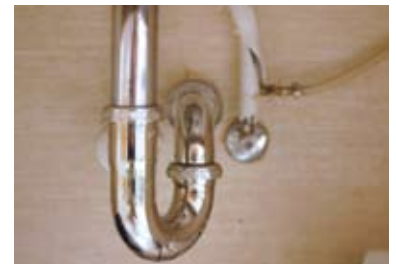
Plumbing leaks and damp basements can be an essential source of water for insects. Get rid of the moisture, and you could solve your bug problem.