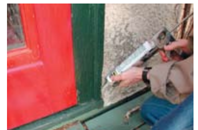
Caulk cracks and weatherstrip windows and doors to eliminate easy paths of entry. Check your foundation for cracks or spaces.