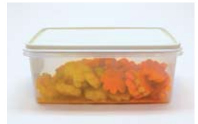
Store food in tightly sealed containers.