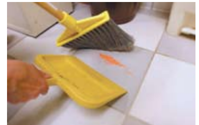
Clean up food spills completely.

If you're looking for a way to decrease your use of toxic chemicals in your home, take a look at how you handle unwanted pests. The best method to control pests, such as bugs and rodents, inside your home is to keep them out by cleaning up crumbs and spills quickly. Instead of reaching for a can of toxic spray, grab a broom!