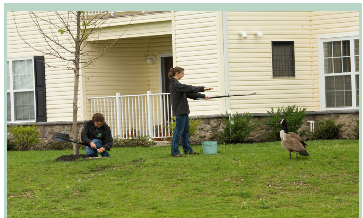
Nest Management is Best Done by a Team of Two People-- One To Treat The Eggs and One To Keep The Geese Away From The Nest

Nest defense behavior by Canada geese is encountered after the nest is located and during the process of moving the adult goose off the nest. Geese must be moved to effectively treat the eggs.